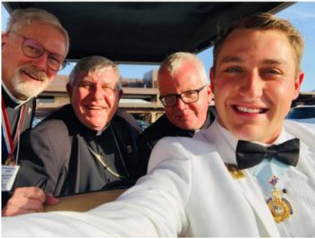
Golf cart selfie @ State Convention!